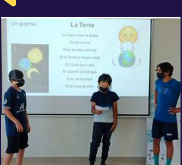
Check out Grade 6 CBR in full Earth Day mode